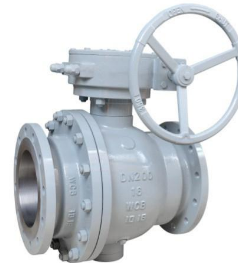
Q347H/Y 固定式硬密封球阀 Fixed hard-seal ball valve

NOMINAL PRESSURE 1.0~4.0MPa, 150Lb~300Lb NOMINAL DIAMETER DN15~200mm, NPS 1/2"~8" APPLICABLE TEMPERATURE -29~425°C (The detailed temperature range depends on the medium properties) CONNECTION FLANGE GB/T 9113, JB/T 79, HG/T 20592, ASME B16.5 VALVE MATERIALS WCB, CF8, CF3, CF8M, CF3M, 310S, Special steel SEALING MATERIALS Hcr, STL, Ni60, WC ACCESSORIES Flange