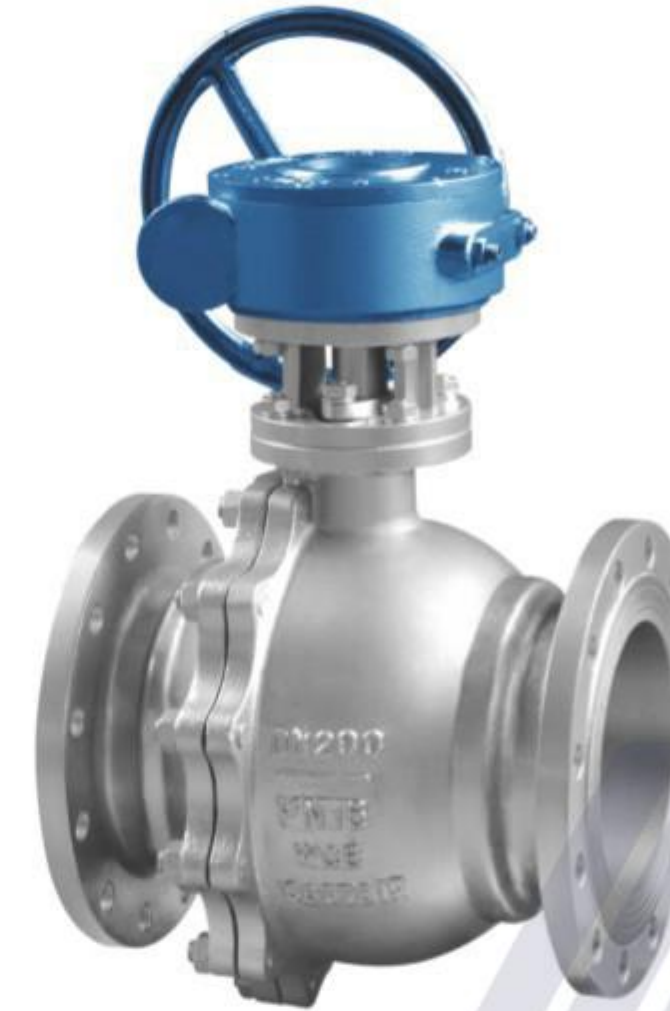
Q341H/Y 浮动式硬密封球阀 Floating hard-seal ball valve

NOMINAL PRESSURE 1.0~4.0MPa, 150Lb~300Lb NOMINAL DIAMETER DN15~200mm, NPS 1/2"~8" APPLICABLE TEMPERATURE -29~425°C (The detailed temperature range depends on the medium properties) CONNECTION FLANGE GB/T 9113, JB/T 79, HG/T 20592, ASME B16.5 VALVE MATERIALS WCB, CF8, CF3, CF8M, CF3M, 310S, Special steel SEALING MATERIALS Hcr, STL, Ni60, WC ACCESSORIES Flange