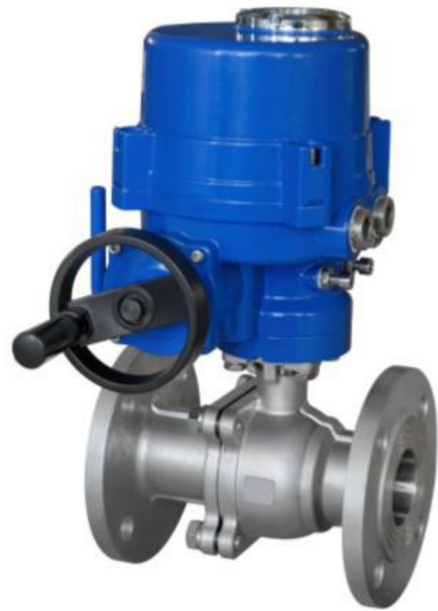
Q941H/Y 电动双向硬密封法兰球阀 Electric two-way hard-seal flanged ball valve

公称压力: 1.0~4.0MPa, 150Lb~300Lb 公称口径: DN15~200mm, NPS 1/2"~8" 适用温度: -29~425°C(具体温度范围视介质性质而定) 连接法兰: GB/T 9113, JB/T 79, HG/T 20592, ASME B16.5 阀门材料: WCB, CF8, CF3, CF8M, CF3M, 310S, 特种钢 密封材料: Hcr, STL, Ni60, WC 配套附件: 安装法兰