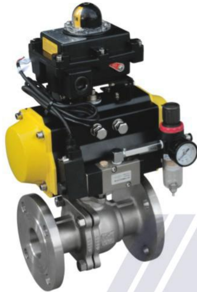
Q641H/Y 气动硬密封法兰球阀 Pneumatic hard-seal flanged ball valve

公称压力: 1.0~4.0MPa, 150Lb~300Lb 公称口径: DN15~200mm, NPS 1/2"~8" 适用温度: -29~425°C(具体温度范围视介质性质而定) 连接法兰: GB/T 9113, JB/T 79, HG/T 20592, ASME B16.5 阀门材料: WCB, CF8, CF3, CF8M, CF3M, 310S, 特种钢 密封材料: Hcr, STL, Ni60, WC 配套附件: 安装法兰